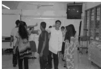
▲ Chinese dance