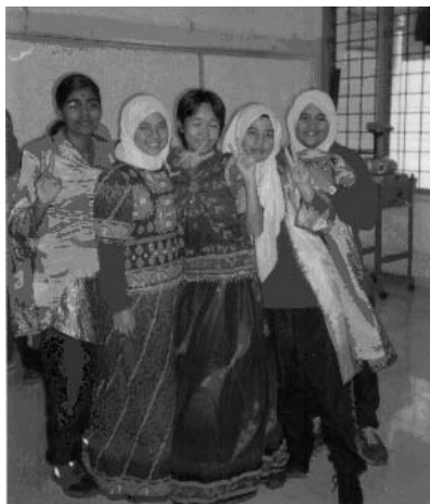
▲ Students in Costumes

the Chinese trader and the other Malay boy acted as the Indian trader (there were no Chinese boys in this group). The scene for the final integrated dance was that of a King's court. The King and his traders would be entertained by the dancers who would perform the three dances.