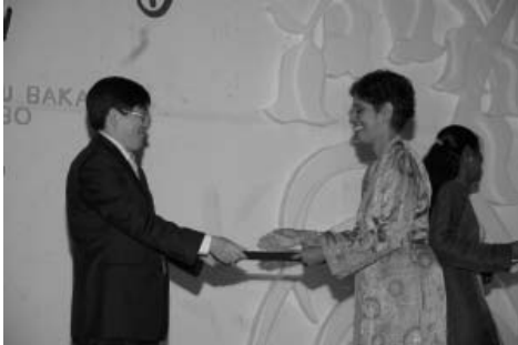
◀ ELP Best Case Study Prize Awarding Ceremony