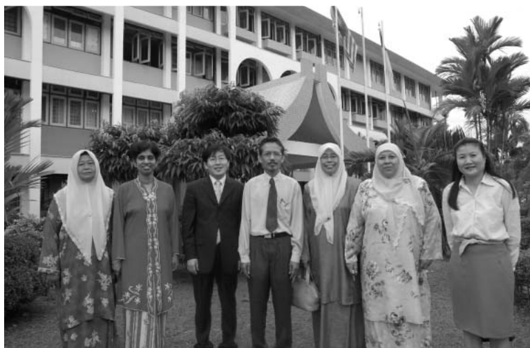
▲ The co-lecturers in front of the IPRM main office