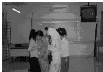
▲ Malay dance