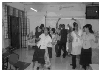
▲ Banghra dance