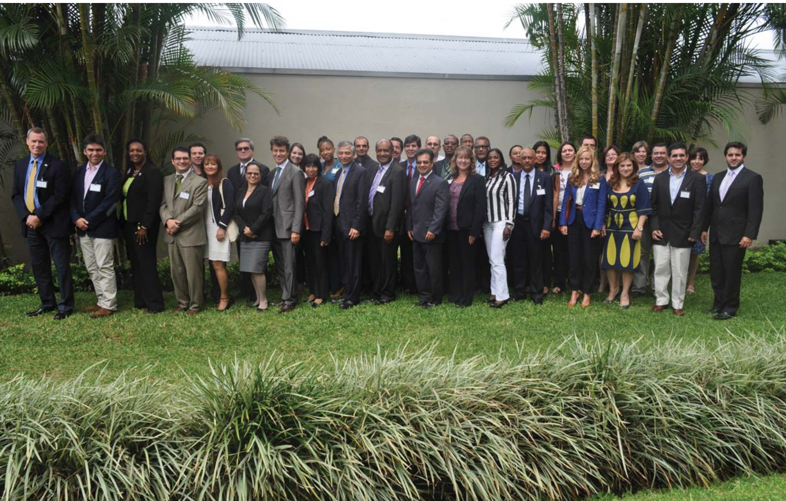
Participants of the LAC regional forum