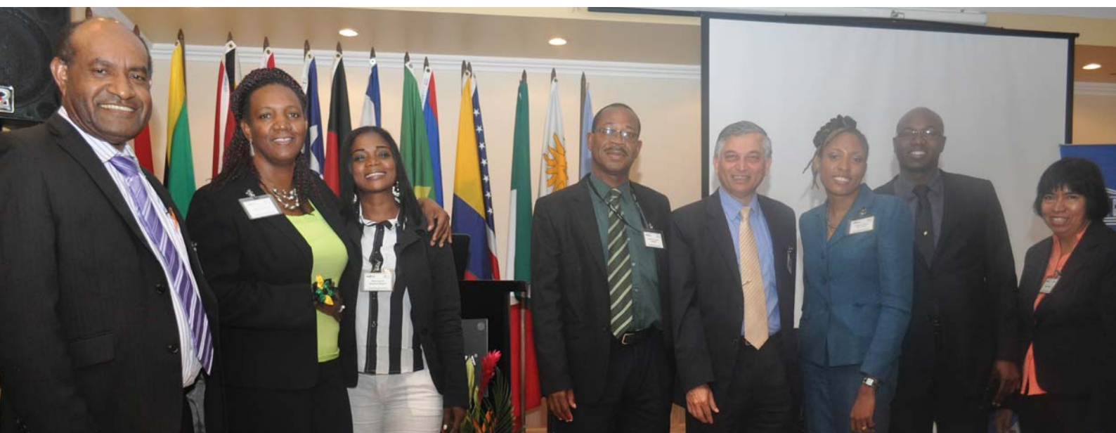
Some participants of the regional forum

The forum was attended by thirty-four participants, representing a total of sixteen countries, mostly from the LAC region, but also from the United States of America (USA) and Canada. The majority of the participants came from UNEVOC centres in the region, although there were also participants from LAC organizations interested in finding out more about the work of the network, as well as other international organizations operating in the region (such as the International Labour Organization, ILO) and UNESCO officials from field offices. A full list of participants can be found on page 22.