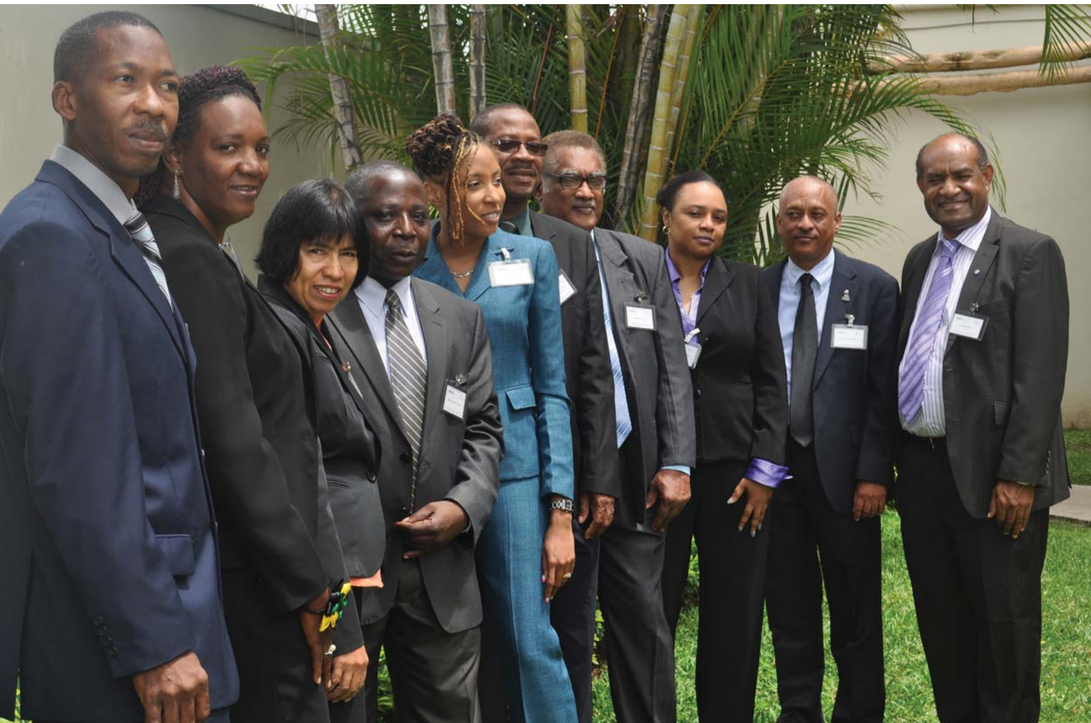
Participants from the Caribbean

Embedding sustainability concepts in the curriculum, and ensuring all graduates have sustainability competencies, underscores the role TVET has in shaping the future Caribbean economy. Greening TVET will