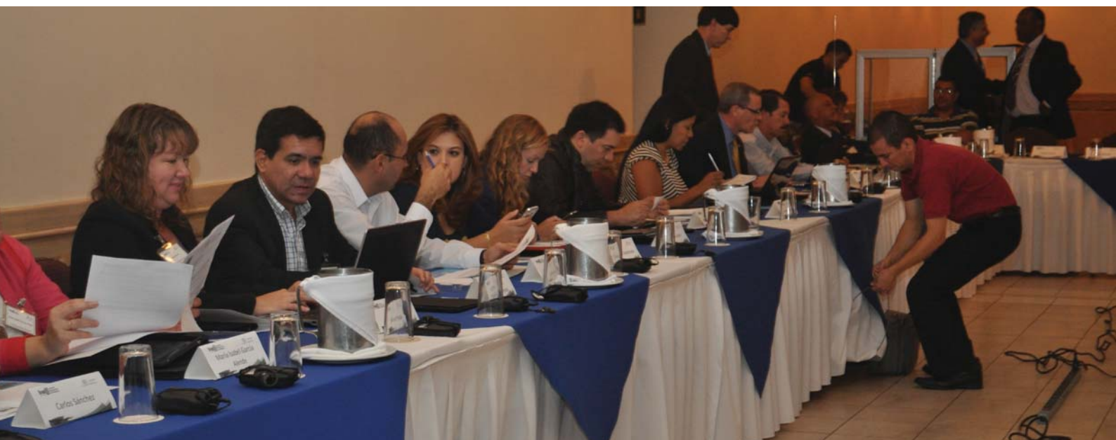
Regional forum participants during a session break