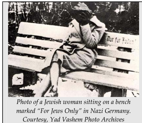
Photo of a Jewish woman sitting on a bench marked “For Jews Only” in Nazi Germany.

In Nazi Germany during the 1930s, Jews were often banned from recreational activities, such as ice skating, swimming and even sitting on certain benches in public parks. Antisemitic signs, such as “Dogs and Jews Are Not Allowed” or “Jews Are Unwelcome Here,” could be seen all over Germany.