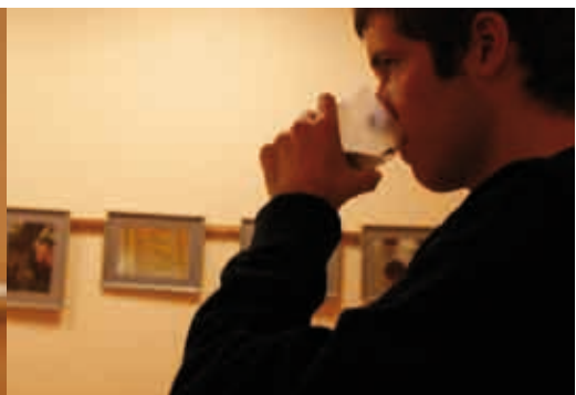
A student DRINKS GREEN!