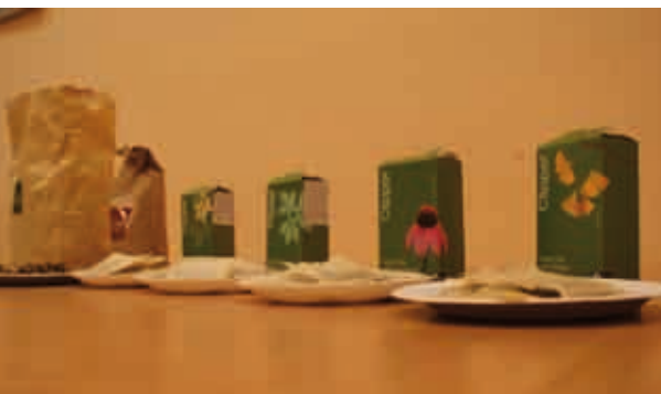
A large variety of Fair Trade teas was shown to the public.