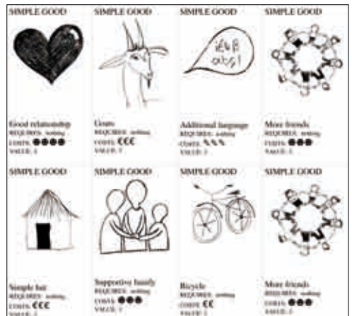
Some of the cards