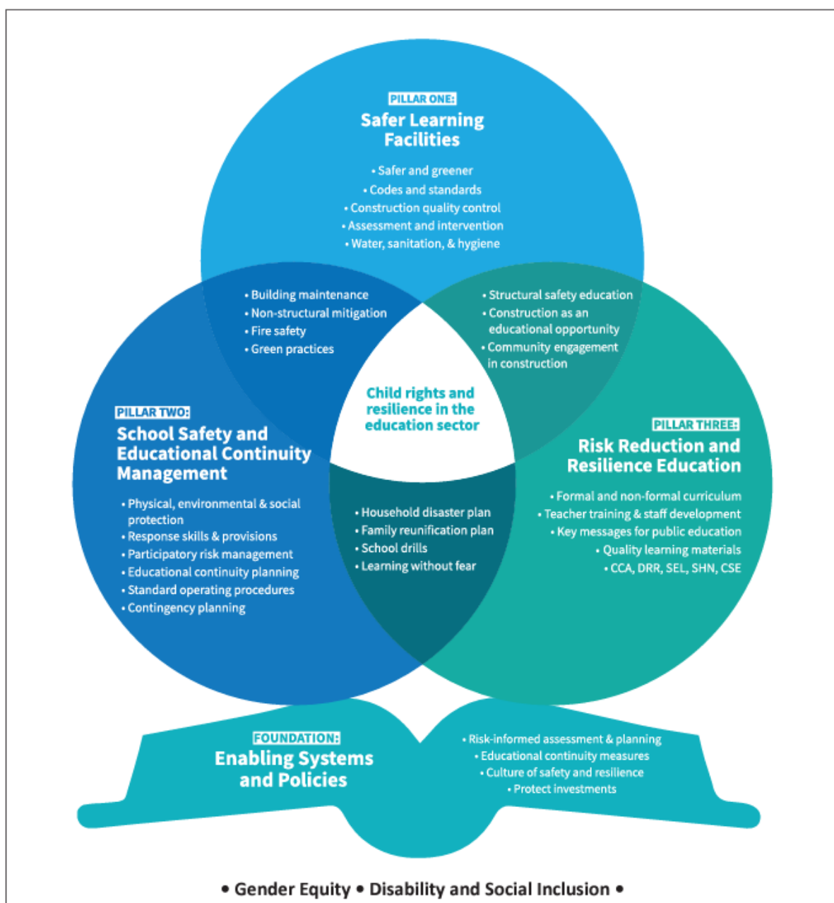
Figure 2: Comprehensive School Safety Framework 2022-2030 41

These three pillars form the foundation of the report's research findings. Pillar One on 'Safer learning facilities' signifies how schools are directly affected by climate change. This is explored in Section 4.1, in terms of how extreme weather is causing immediate barriers to school attendance or difficulties in learning.