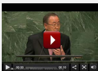
Secretary-General Ban Ki-moon's address at the opening of the Post-2015 Development Agenda Summit