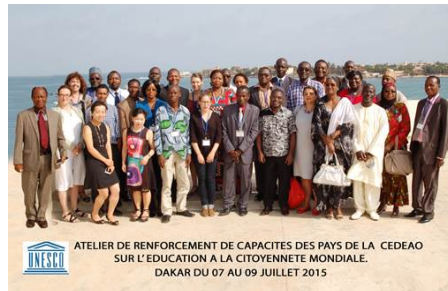
ATELIER DE RENFORCEMENT DE CAPACITES DES PAYS DE LA CEDEAO SUR L'EDUCATION A LA CITOYENNETE MONDIALE. DAKAR DU 07 AU 09 JUILLET 2015