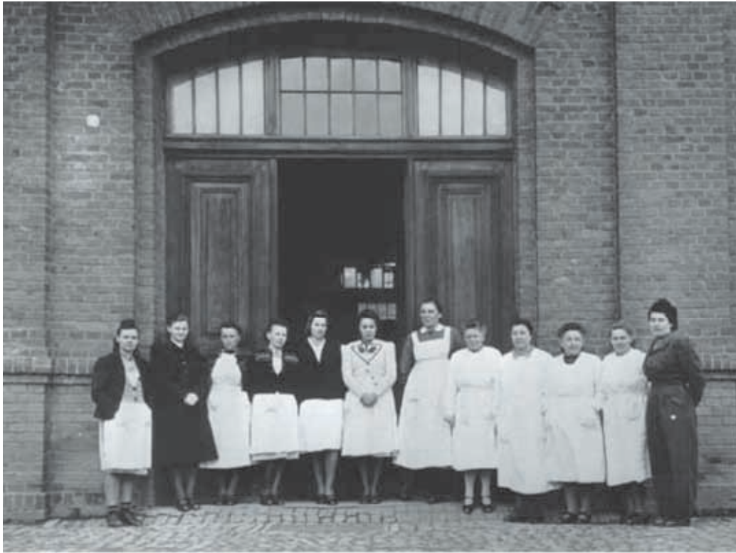
Rewve Ñawndoove wonve e Nokku «Jokkitirdu Pittaali» To Hadamar, Almaañ