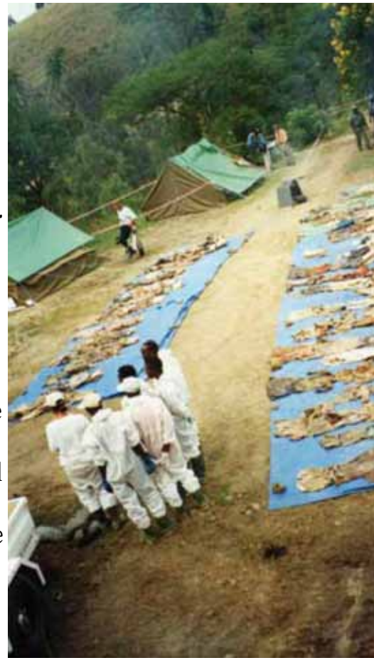
Wiiduru waraave to Rwanda

Leyqeele poolnooqe e wolde qimmiire e hitaande 1945 njiqiino ñifde qiin warhooreeji. Qe vulninooma kadi nanondiral winndereyankeewal darantoongal paltagol baqe warleŷŷi (Gaadondiral Dowlaaji Dentuqi ngam paltagol e havagol warhoore huccinaande e leŷŷi ko e hitaande 1948). Caggal wolde aduna qimmiire, waqii e senngooji aduna hee fof, musibaaji goqqi ciforiiqi noon Caggal huccitde e qii warhooreeji neqqaagal baqooji sahaa fof, dawroyankeewe, wiqtoove kañ e vivve-leydi aduna oo fof, kamve fof, ve tuugniima e taarik e binndanqe ngool Duppal ngam qavvitde no ina faamiree no winndere ndee fergitirii, waasi faltaade ngol warleñol. Hol ko janngugol Duppal e warhooreeji goqqi qi waawi jannginde e ko yowitii e paltagol warleŷŷi e fitinaaji pakitqi ?