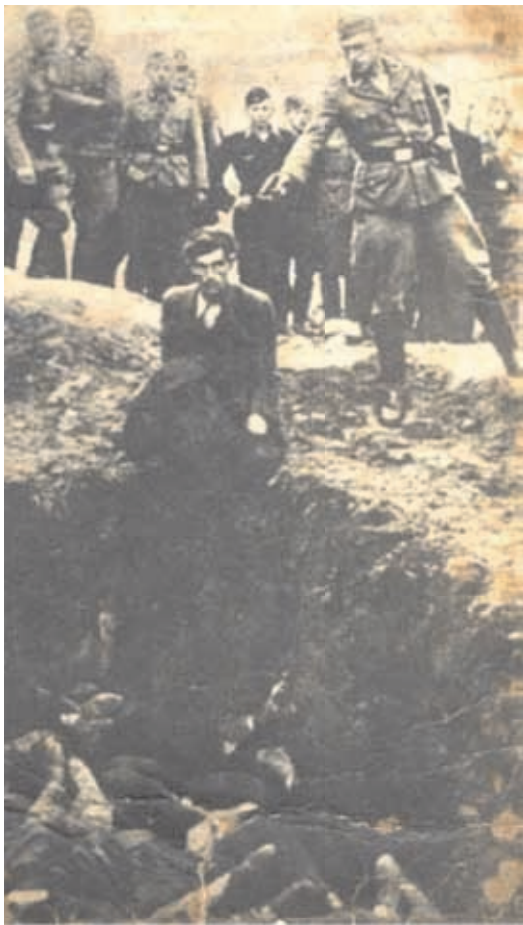
Harbiyaŋkoove almaaŋnaave ina ndaara neqqo «Gollal T.» ina wara yahuuduyaŋke, Vinnitja, Ikireen, Sulyee 1941

Qeen qoon kuule, qe mbonii e yahuudu'en. Nde vooynoo, qe mbaqtindii ko lañcude e boomde yahuudu'en wonve e nder leydi Almaaŋ e nder huunde e leyqeele Orop. Quum ina anndina darnde e defaare laamu e ngol ñaaygol hakkeeji aadee ngol seeraani e layde. Ko noon kadi anndiraa darnde e defaare kala aadee e denndaangal renndo e qe ñaayqeele hakkeeji. Yeru goqqo o ko golle qe doktoreeve almaaŋnaave mbaqi e nder lelngo «jokkitirdu pittaali» ngo Almaaŋ lelnunoo, w'i qum « Gollal T4». Ngoon lelngo saabiima maaygol ko ina vura 200 000 neqqo ; worve e rewve e sukaave ustiraave terqe maa hakkillaaaji. Hono noon kadi , yimve konu Almaaŋ njeyaama e boomgol ko ina vura miliyoŋ yahuuduyaŋke.. Ndeen boomaare waqi ko e nder leyqeele Orop banngge fuqnaange caggal nde harbiyaŋkoove heeroriivee warngo naati e hare hee. Taweede nguun konu e ngool boomgol ina adda miijitaade ko fa'ti e sababuuji gaddanooqi renndo yimve tawtude laamu e ñaaygol sariya winndereyaŋkeewa. Janngingol Duppall ina waawi wallitde sukaave ve faamde maanaaji teertuqi qi ina naftoya ve e janngugol fitinaaji pakitqi qi sifaaji goqqi. So ve njannngoyii taarik ñaaygol hakkeeji aadee goqqi cemmbuqe, maa almudve vee mbaawoy tuugnaade e ganndal mavve e Duppall, ve paamana ko'e mavve baqqiiqi mavve, sabu wonde- ve vivve-leydi aduna fof.