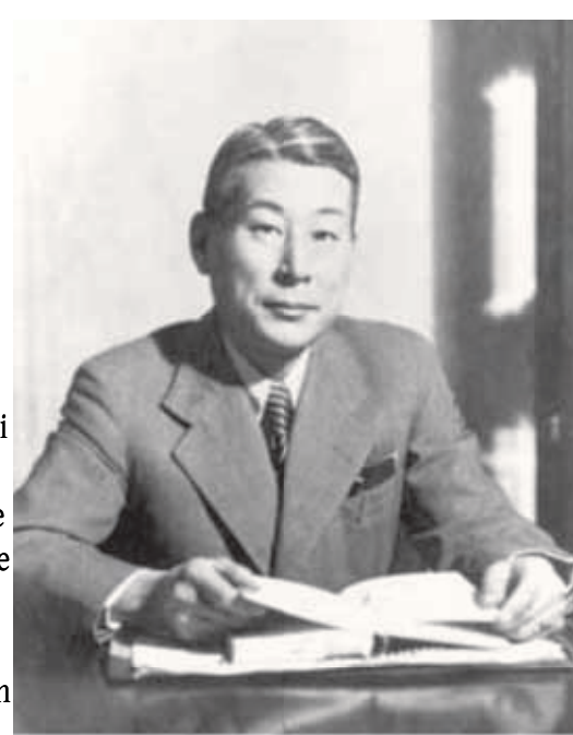
Konsil Japoj to Kowno, Siyuun Sempo Sugihara, tottirii ko vuri 2 000 wiisa newnanqo yahuudu'en moolinoove iwde Orop

E yeeso woqngo, keelqeendi qeen golle feeñii no moƳƳi e darnde nde diiniyaŋkoove ndarii ngam salaade evvo « Gollal T4» yowitinoongo e jokkitde pittaali veen ustiive terqe wonnoove Reish. Ina maantaa kadi golle qe rewve almaañnaave waqi. Veen reewve ngonaano yahuudu'en. Kono, e lewru feburiyee 1943, veen rewve kebbin dille ngam salaade nanngal worve mavve yahuudu'en. Ve ceeraani e heblude moovondire e noddude jartodingol haa ñande worve mavve qaccitaa e lewru marse 1943. Qii yeruujji kolliti ko golle moƳƳe qe aadee e qe dente fof, eqe mbaawi wuurtude haa moƳƳa laamuujji lorlooji, kaqooji vivve-mum-leydi hakkeji mumen garwaniiji.