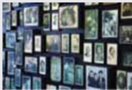
Wejo nate vesngu to Moftorde Pine ngenndiire nde Oswits- Birkeno

Kono, so wonii to senngo karallaagal janngingol waqgol wiqto evvinirngo warleYYi ko huunde ittunde, ina haani moYYa tawa yerondiraaka lorraaji, heddee tan e wiqtude saangaaji oon taarik. So ve naatani jannginginde Duppal, janngingoove ve poti waqtude hakillaaji mumen tan ko e qeen dawruqe keewqe lañcooqe qe njuvvini almaañnaave e wallidiive mumen. So ve kuccanii warleYYi goqqi, ve poti ko turaade e dawruqe gooto e mavve fof.