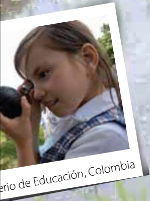
Ministerio de Educación, Colombia

The Sierra Gorda Earth Center Roberto Ruiz Obregón , within the Sierra Gorda Biosphere Reserve in Mexico, organizes courses and workshops for those who work for natural protected areas. It offers an online diploma course adapting the UNESCO “Teaching and Learning for a Sustainable Future” programme to local needs.